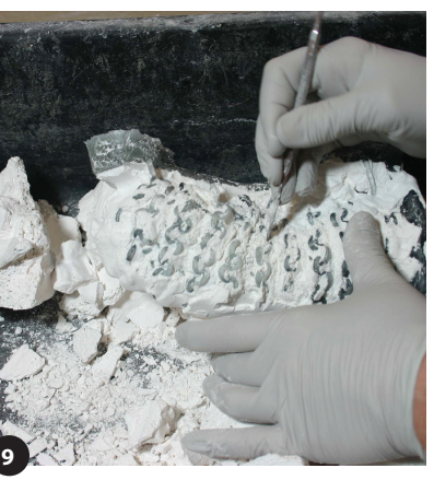
After the mold has cooled, material is carefully removed to reveal the finished piece