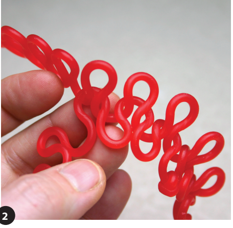
"Knitting" the pieces together by hand, twisting together the ends when adding a new strand.