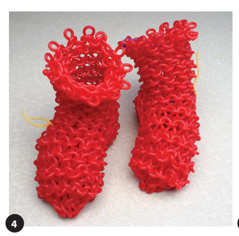
The completed pair of wax socks.