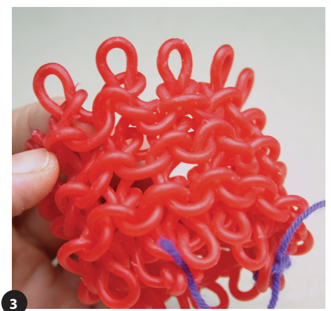
Gradually, the knitted wax form takes on a sock-like shape.