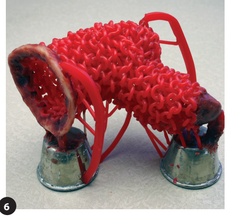
The "sprued" sock sculpture is ready to be "invested" or surrounded with several coats of a "refractory" mold material that withstands high temperatures.