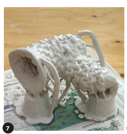
The first of several layers of mold material applied to one of the sock sculptures. The mold material is built up to a thickness of 1–2 inches.