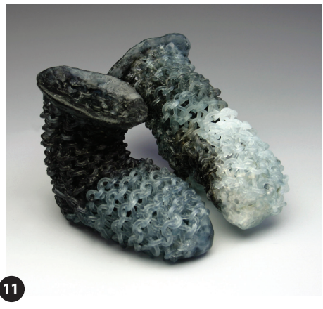
A final surface polish with pumice completes the pieces Salt and Pepper (2011).