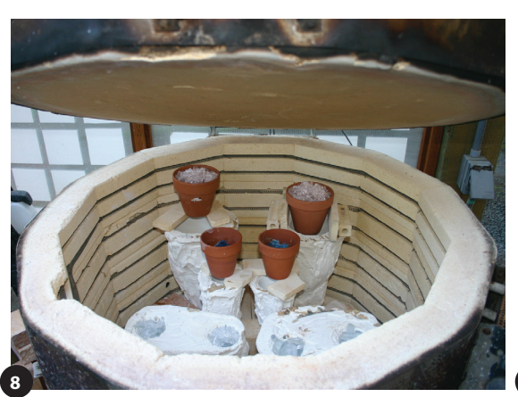
The mold is placed in a kiln upside down and lead crystal "frit" or chunks are place in the mold or in a flowerpot above the mold. The kiln temperature of 1,530°F melts the glass into the mold.